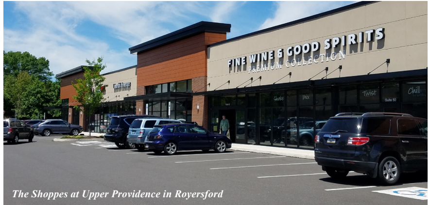
The Shoppes at Upper Providence in Royersford

This report contains an annually updated inventory of shopping centers and a map showing approximate locations for each. By providing the information on existing centers, their locations, and characteristics, this report not only provides a useful resource for shopping but also, when combined with other available information, suggests where opportunities may or may not be for the development of additional shopping centers and retail opportunities in the county. The retail additions to the county are accurate to the end of 2018.