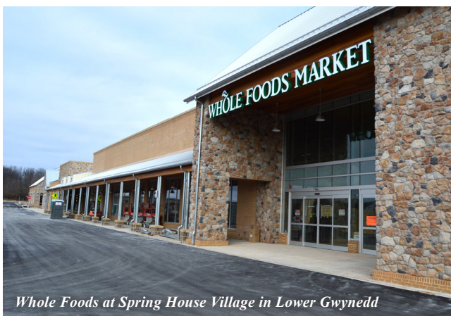
Whole Foods at Spring House Village in Lower Gwynedd

124,499 Gain of new shopping center square feet in Montgomery County in 2018